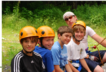
A group of campers hanging out at the 52 foot Climbing Wall.

a packet of information to help you prepare for your child's stay with us.